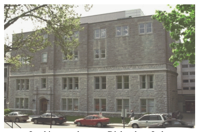
Looking southeast at Richardson Labs