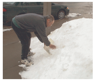
Figure 3 - what happens when your coldbitsmaker dies.