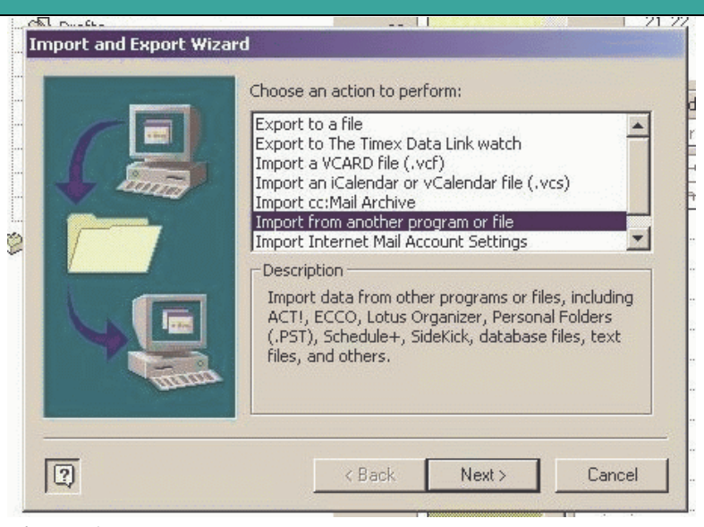
Figure 6 - step 1

1) choose import from another program or file