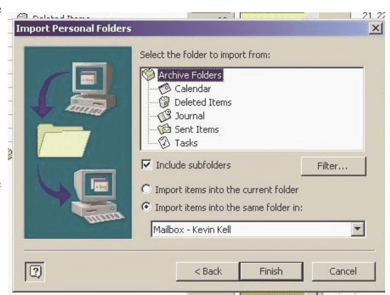
Figure 9 - step 4