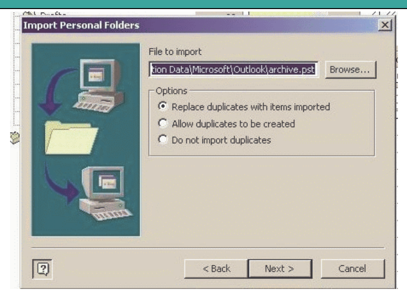
Figure 8 - step 3