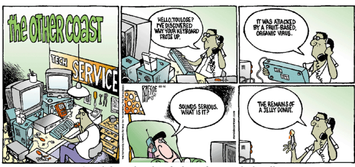
A reminder to please keep food away from your keyboard!