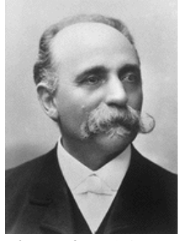
Figure 4. Golgi

The collaboration of Wilhelm His, Heinrich Wilhelm Gottfried von Waldeyer-Hartz, and Fridtjof Nansen has been generally accredited as originators of the neuron theory of the nervous system. Nansen's doctoral thesis was entitled, "The Structure and Combination of Histological Elements of the Central Nervous System", 1877.