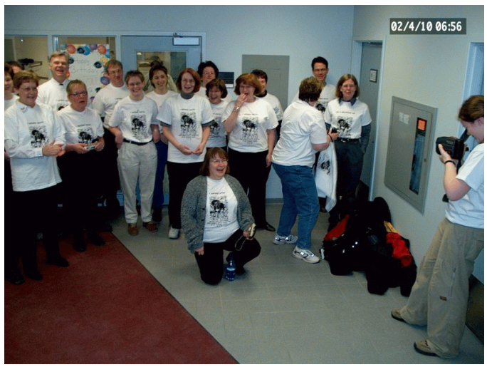
Figure 10 - Crowd gathering to see a 350 years old (dog years) on his birthday.

http://www.path.queensu.ca/queens/lisimage.htm