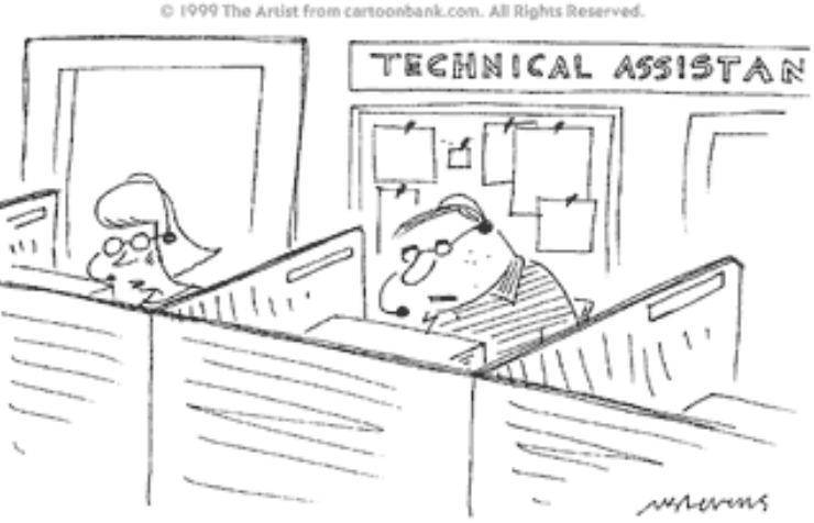
"Is the window open? Good. Now, very carefully pick up your computer. Carry it over to the window. Now throw the computer out of the window."

Leggett said he felt the budget's allotment for post-secondary education fell short of the mark, but that the government should be congratulated for a