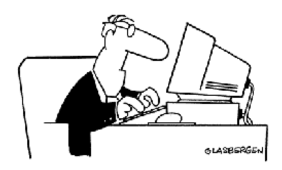
"Effective immediately, all Y2K jokes and cartoons shall be forbidden in the workplace, as they may be offensive to the computers on our staff."