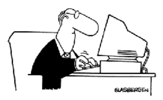
"Our company is making considerable progress in preparing for the Y2K crisis. Next month, our top people will be attending a seminar, where we hope to find out what Y2K stands for."

The 62<sup>nd</sup> Annual Meeting of the Ontario Association of Pathologists was held October 1-2 at the picturesque Clevelands House Resort on Lake Rosseau in the Muskokas. It was well attended by approximately 80 community and