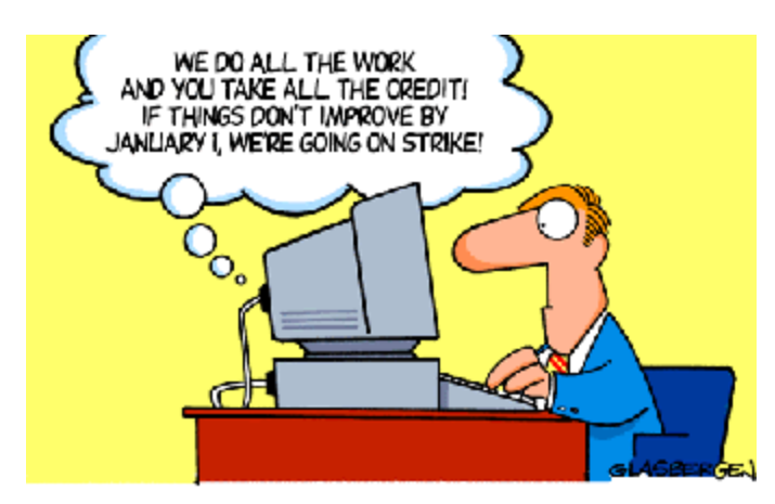
The Truth About Y2K.