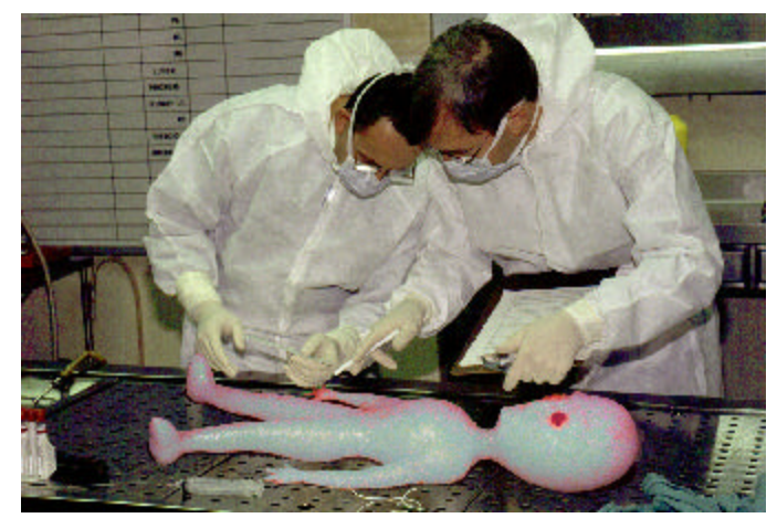
Figure 2 And which granting agency provided funds for this particular bit of Alien Research? DoD? CIA?