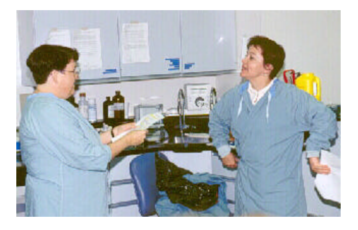
Monday September 7<sup>th</sup> Labour Day

Friday April 10<sup>th</sup> Good Friday Monday May 18<sup>th</sup> Victoria Day Wednesday July 1<sup>st</sup> Canada Day Monday August 3<sup>rd</sup> Civic Holiday