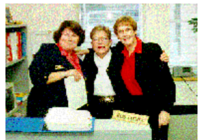
These people are *way* too happy.

Dilbert's Laws of Work: Important letters that contain no errors will develop errors in the mail.