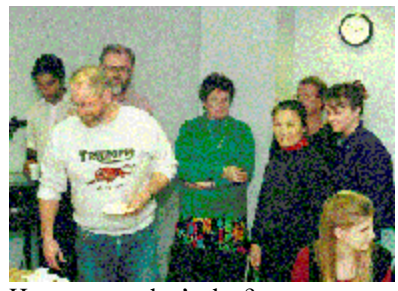
Hmmmm... what's that?