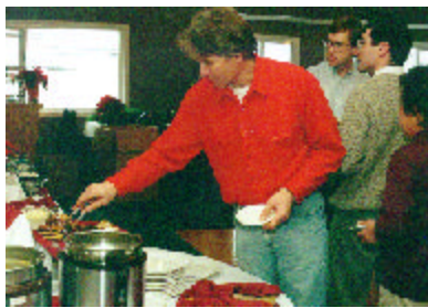
Now this *can't* be as good as the stuff I make!